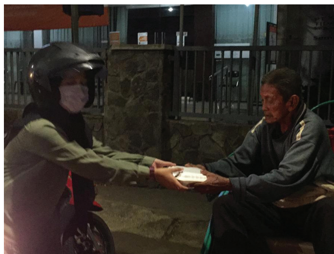
BEM UNAIR Activity in distributing food to the community