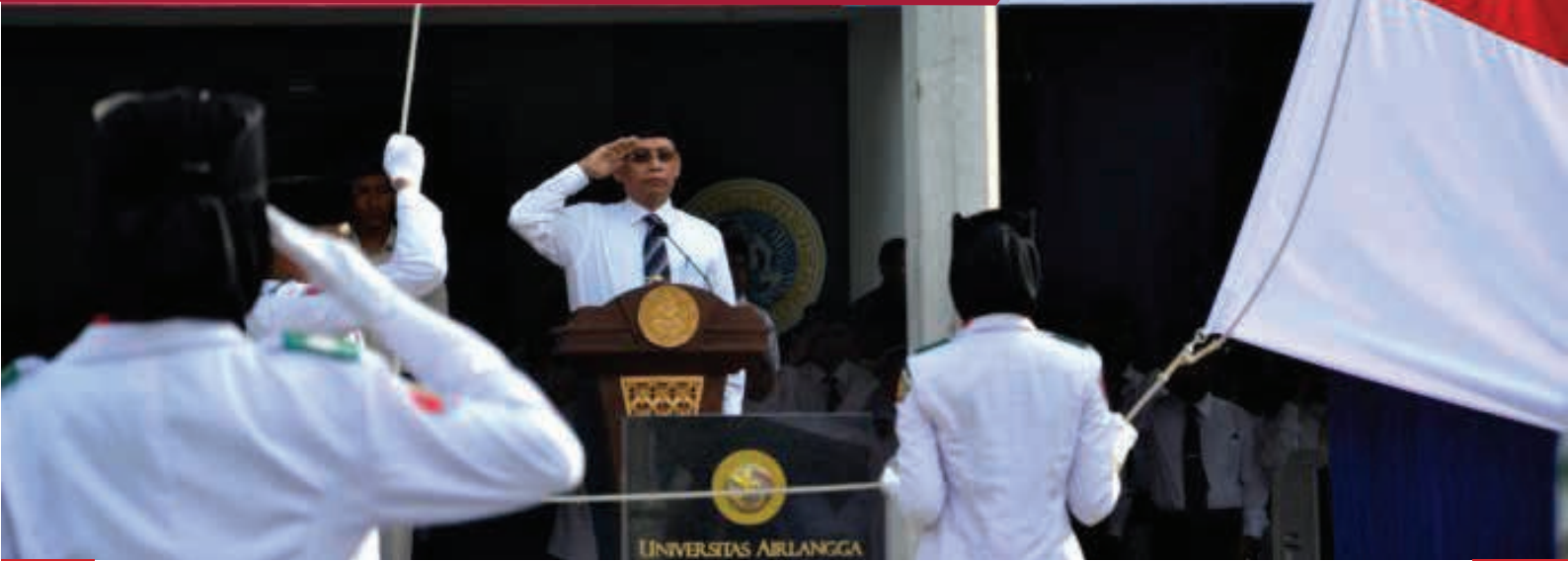
▲ Heroes Day Flag Hoisting Ceremony on 10 November 1, 2018 in the yard of UNAIR Management Office Building; also the day Universitas Airlangga celebrates its 64th Anniversary.