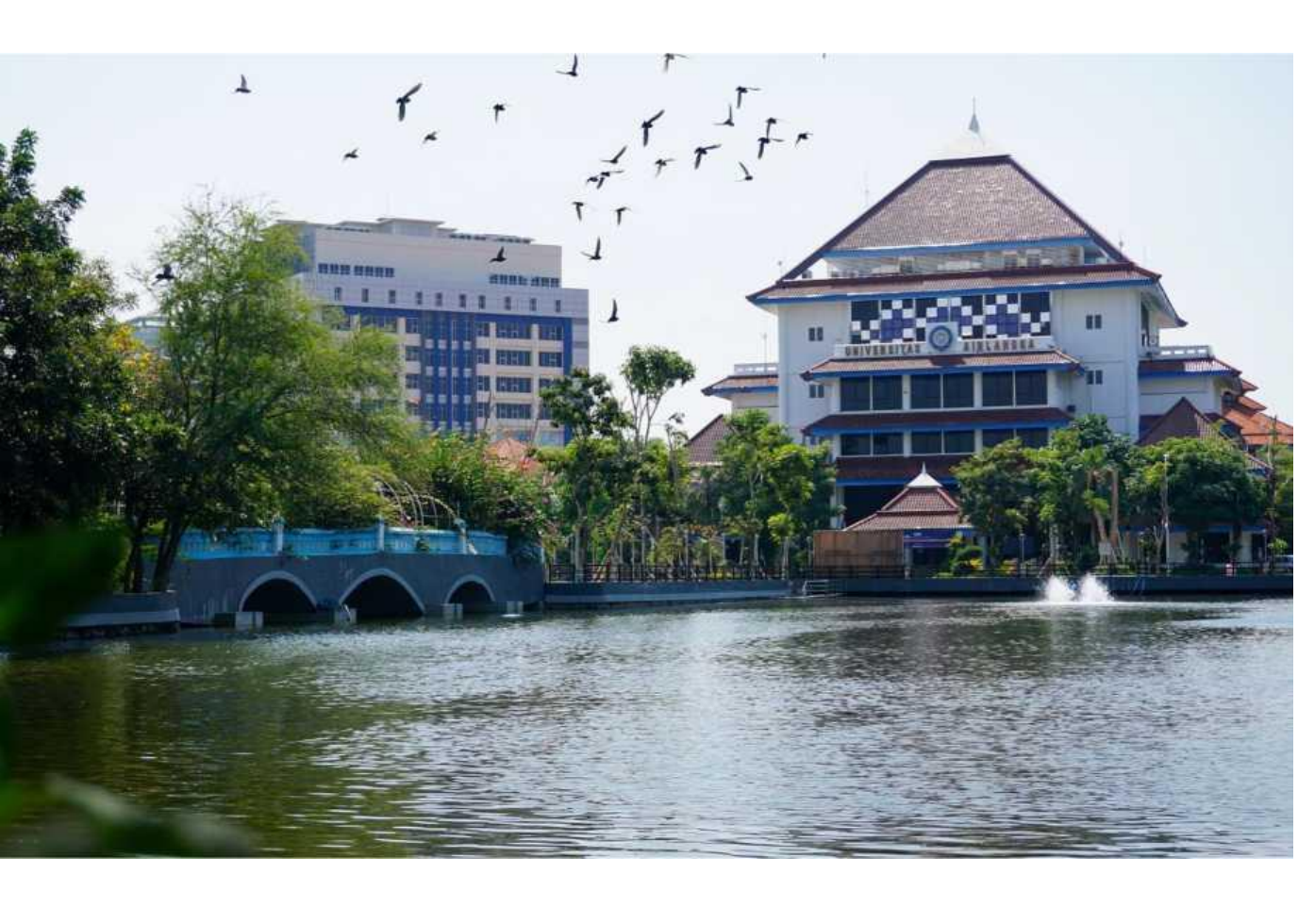
VISION, MISSION, AND OBJECTIVES